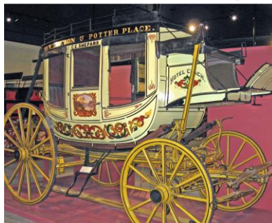
Coach #425 Abbot-Downing Co. – 1874 New London Historical Society