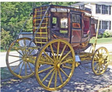
Francestown - Unknown Number Town of Francestown, New Hampshire