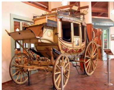
Coach #425 Abbot-Downing Co. – 1874 New London Historical Society